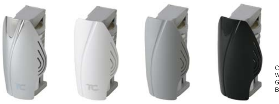
Chrome Dispenser White Dispenser Gray Dispenser Black Dispenser

The world's first continuous odor control system is the latest innovation by Technical Concepts. Utilizing its patented fluid delivery system, the TCell delivers a precise dose of pure designer fragrance and odor neutralizer for 60 days without the use of batteries.