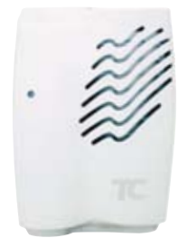
750180 Fan Dispenser

Preference Pack 402236 1(5) 0.11 2.0 lbs. (Contains one refill each of Wakening Spring, Polar Mist, Blue Splash, Citrus and Crystal Breeze)