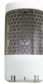
402430 Heavy Duty Dispenser